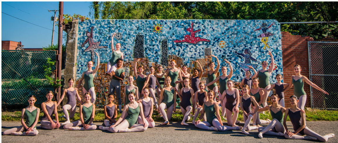
Southwest Virginia Ballet Company Members 2023-2024

This performance is made possible in part by a grant from the Virginia Commission for the Arts, the National Endowment for the Arts and the Roanoke Arts Commission.